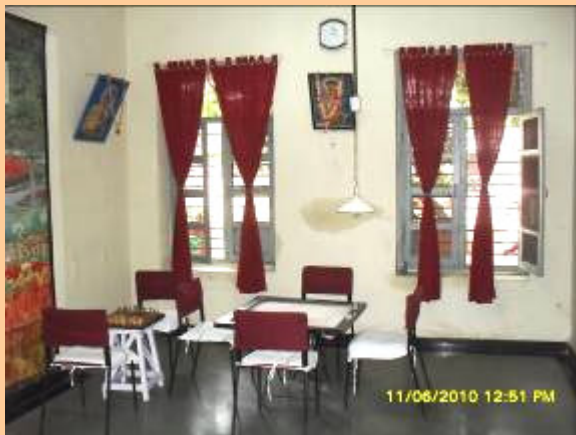
SOPHISTICATED RECREATION ROOM