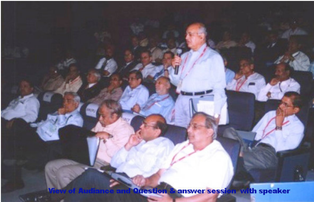
View of Audience and Question & answer session with speaker