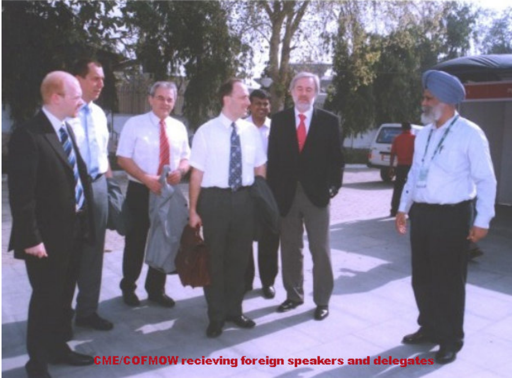
CME/COFMOW receiving foreign speakers and delegates