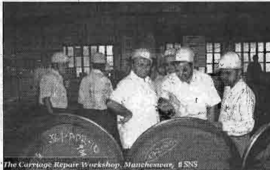
The Carriage Repair Workshop, Mancheswar. || SNS

CRW has a capacity of holding 100 coaches